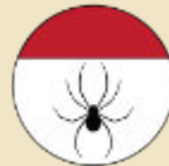
Web Minister: Baroness Glynis Not Present