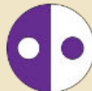
Youth Officer - VACANT