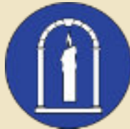
Minister of Arts and Sciences: Lady Harper An Cu Present